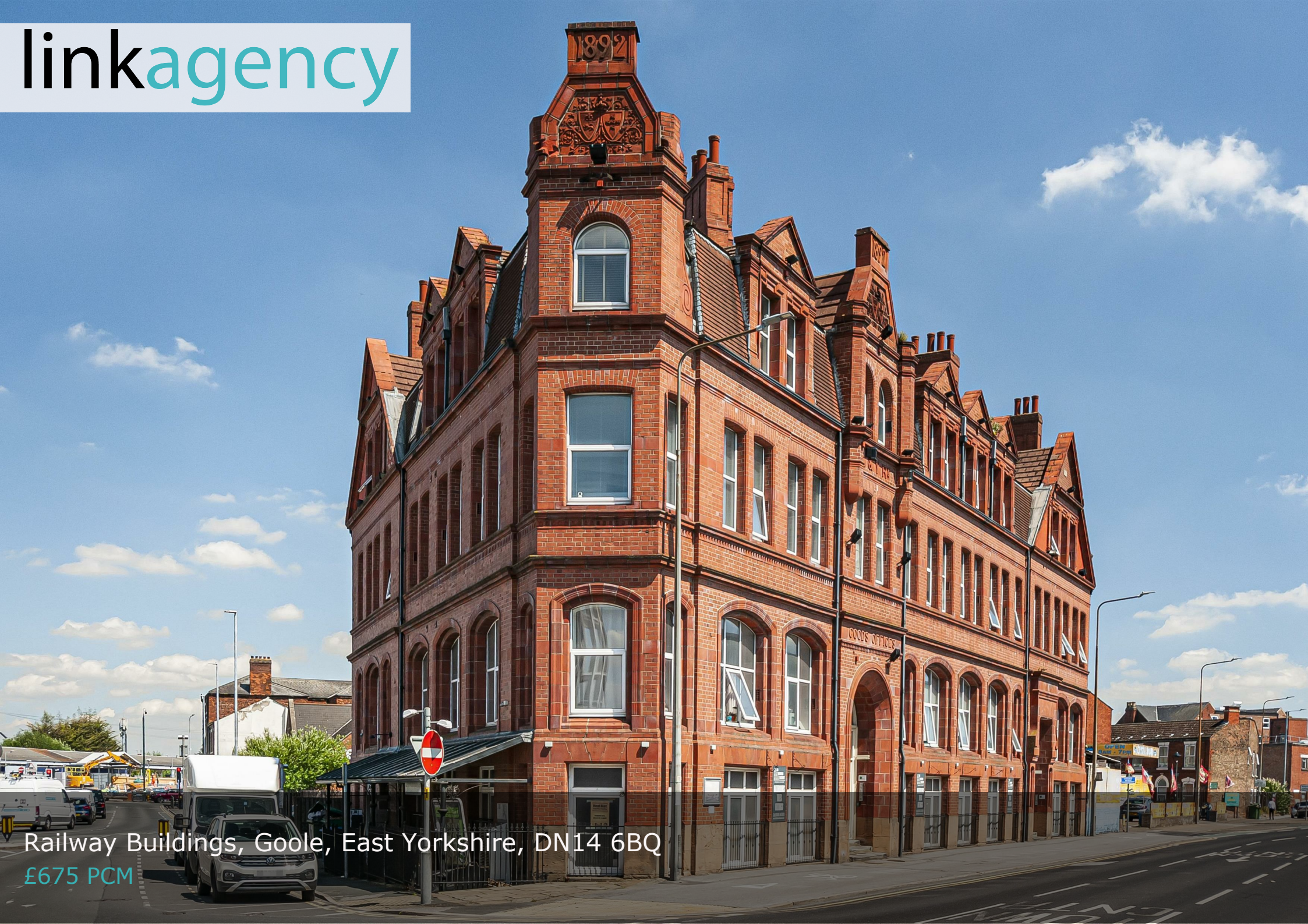
Railway Buildings, Goole, East Yorkshire, DN14 6BQ